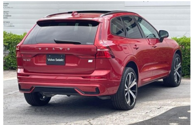
Volvo Selekt Approved Used Cars