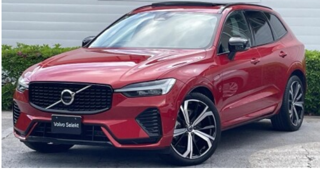
Volvo Selekt Approved Used Cars