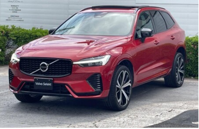
Approved Used Cars