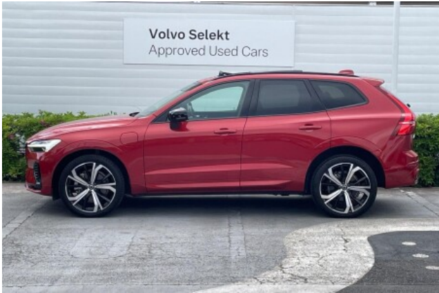
Volvo Selekt Approved Used Cars